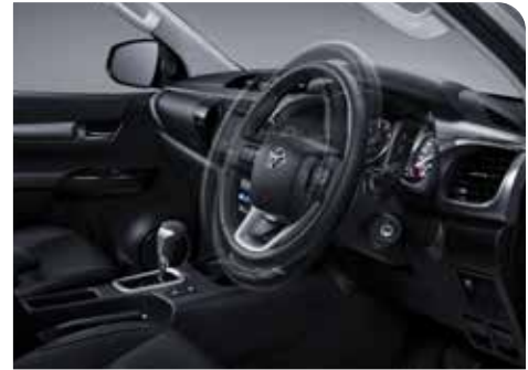
Steering Adjustment With the tilt telescopic feature to adjust the position to make it more comfortable for anyone. (All Type Double Cabin; Single Cabin DSL 4x4 Type)

Elegant Dasboard Colour A black dashboard color to enhance the interior's elegance for your luxurious driving experience. (E Type Double Cabin)