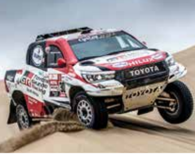
50 years of realibility and endurance delivering the 2019 Dakar World Championship