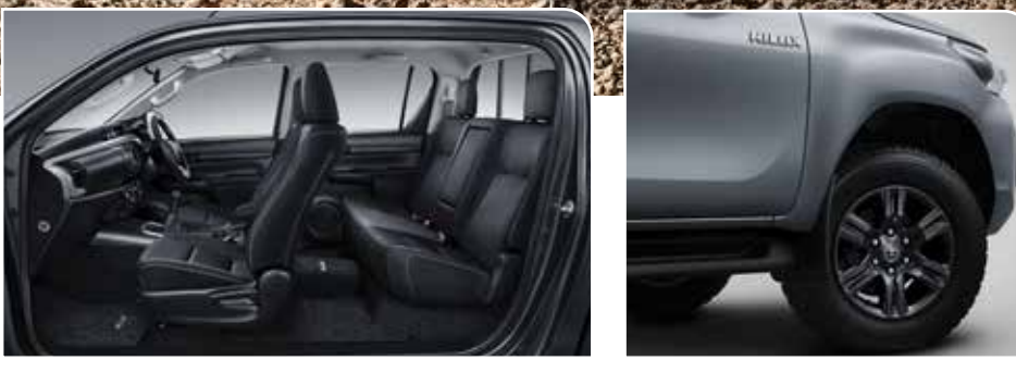
Prominent Black Seat Color Bringing the toughness even to the inside, with a luxurious and strong black with grey pattern. (G Type Double Cabin)